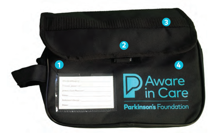
Step 2: Pack Your Aware in Care Kit

In addition to helping you understand how to get the best care possible in the hospital, your Aware in Care kit can be useful in helping you prepare for a hospital